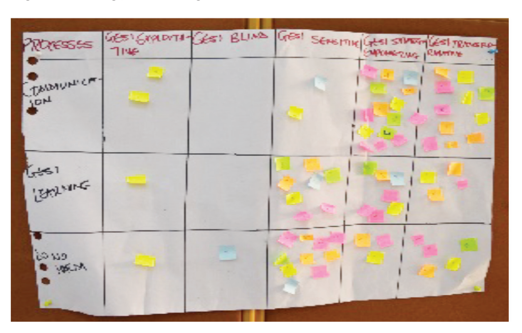
Diagram 2: Scoring process using the GESI continuum