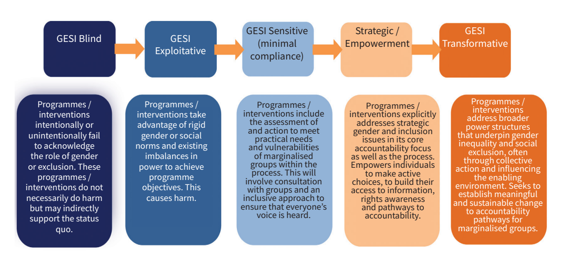
Diagram 1: GESI Responsiveness Continuum

The GESI Responsiveness Continuum is shown in Diagram 1; case study examples can be found in Annex 2 .