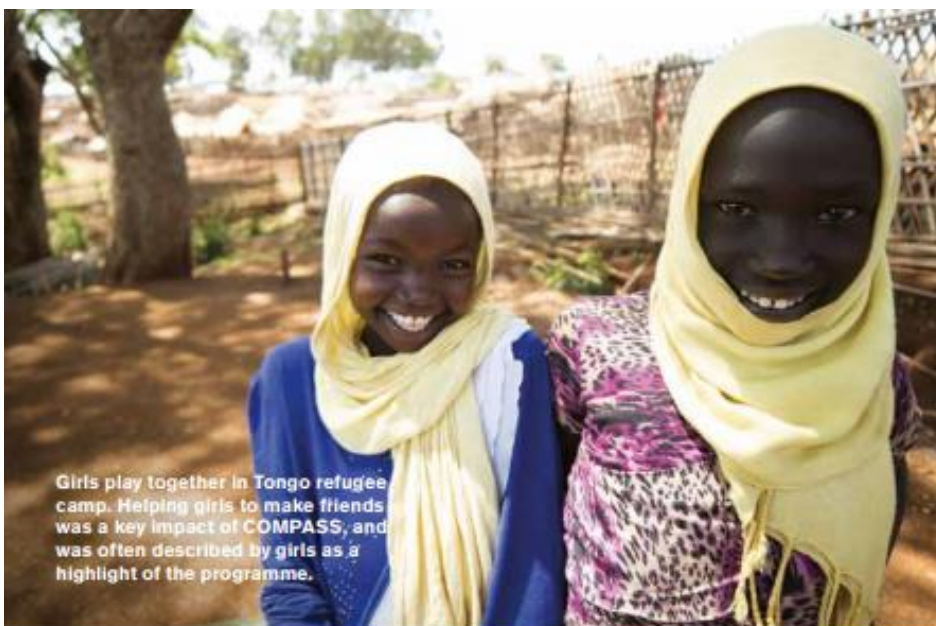
Girls play together in Tongo refugee camp. Helping girls to make friends was a key impact of COMPASS, and was often described by girls as a highlight of the programme.

Image from IRC, 2017. Photo Credit: Meredith Hutchison