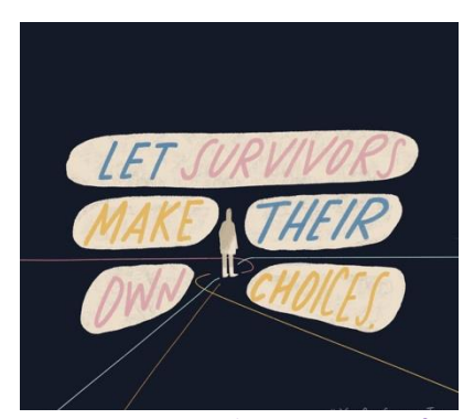
Figure 1: image credit ICRC, Asia Pacific

The term survivor-centered originates from the work of women's rights activists providing support and services to women experiencing sexual and intimate partner violence.<sup>2</sup> Now a common term used globally in the context of GBV service delivery, survivor centered describes a supportive, compassionate approach to working with a GBV survivor that focuses on promoting her safety and facilitating her agency – her power within and to. A survivor-centered approach draws from feminist, social work and trauma-informed theory and practice.<sup>3</sup> It is a helping process that is intentionally therapeutic- by seeking to facilitate healing and recovery-- and political—by seeking to redress patriarchal systems, norms and practices that are the cause of interpersonal and systemic forms of GBV.4 These therapeutic and political goals are interconnected and are facilitated in parallel as a service provider works with a survivor.