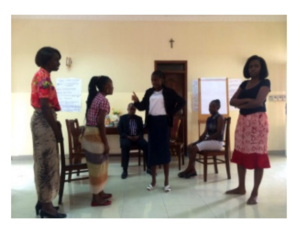
Photo: Girl researchers acting out examples of empowerment and disempowerment in their research

The research team therefore undertook a participatory exercise with the girl researchers to brainstorm and unpack terms in French and Lingala related to ideas of autonomy, independence, decision-making power, capability, respect, and value. The results of this exercise are summarised in the table below (see figure 2).